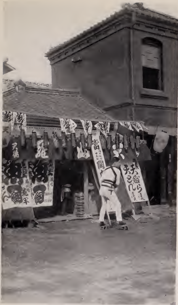
A sake shop in Tokyo, Japan